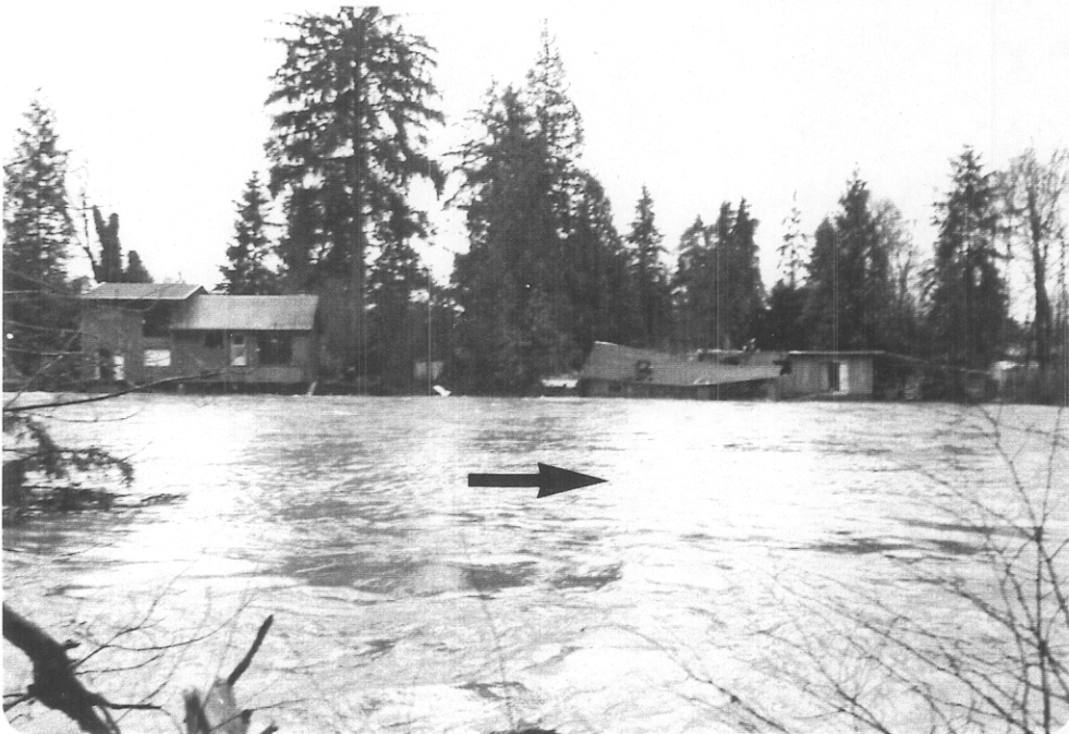
PHOTO 2 ALOUETTE RIVER LOOKING ACROSS TO LEFT BANK AS ABOVE