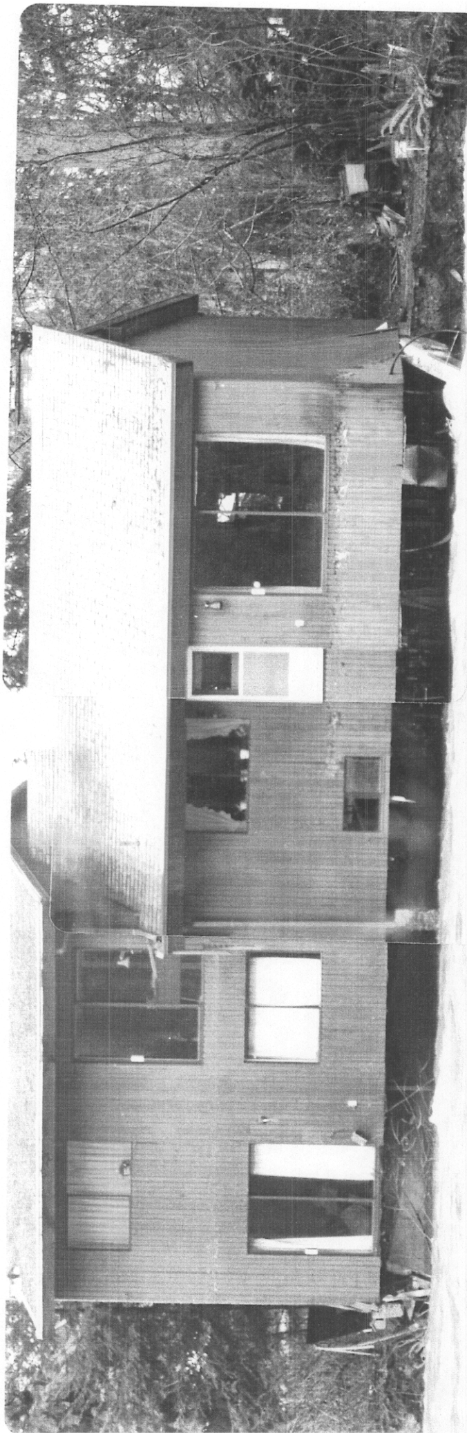
PHOTO 3 ALOUETTE RIVER FLOOD STAGE DECEMBER 1980 CLOSE UP OF PHOTO 2 NOTE FOUNDATION DAMAGE ETC.