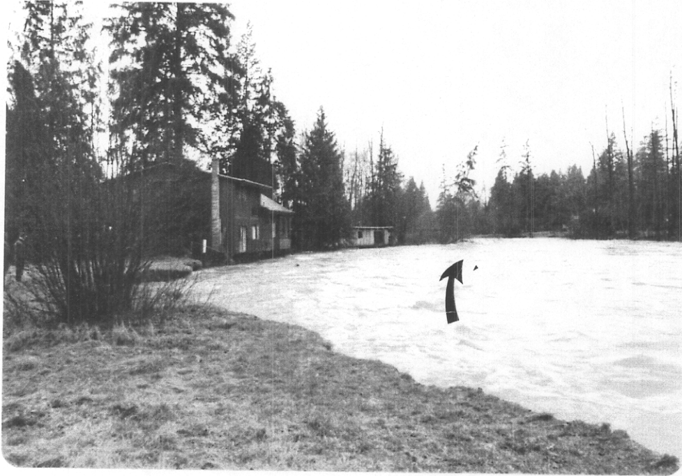
PHOTO 1 ALOUETTE RIVER LOOKING DOWNSTREAM FLOOD STAGE DECEMBER 1980 VICINITY OF XS 13